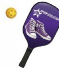
SINGLE PLAYER PICKLEBALL SET $60 Includes one paddle and one ball.