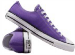
LOW TOP CONVERSE $250 Men's and Women's sizes available.