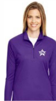
WOMEN'S QUARTER ZIP JACKET $110 S, M, L, XL, XXL