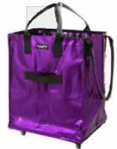
HULKEN FOLDING TOTE $330 16" x 12" x 22"