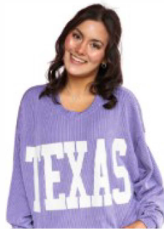
WOMEN'S CORDED PULLOVER $110 S, M, L