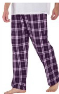
MEN'S FLANNEL PJ PANTS $110 XS, S, M, L, XL, 2XL