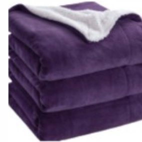
THROW BLANKET $110 108" x 90"