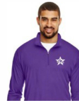
MEN'S QUARTER ZIP JACKET $110 S, M, L, XL, XXL