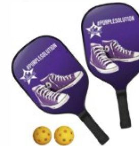
DOUBLE PLAYER PICKLEBALL SET $120 Includes two paddle, two balls, and drawing bag.