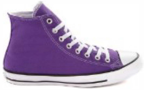
HIGH TOP CONVERSE $250 Men's and Women's sizes available.