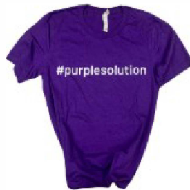
#PURPLESOLUTION T-SHIRT $25 S, M, L, XL, 2XL, 3XL, 4XL