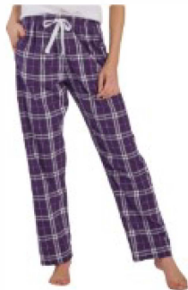
WOMEN'S FLANNEL PJ PANTS $110 XS, S, M, L, XL, 2XL