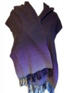
PASHMINA WOOL SCARF $75 One size fits all.