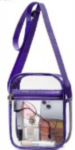
CROSSBODY BAG $40 9" x 6.75" x 2.5" with 2 compartments.