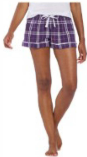
WOMEN'S FLANNEL PJ SHORTS $110 XS, S, M, L, XL, 2XL