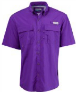
MEN'S FISHING SHIRT $75 S, M, L, XL, 2XL, 3XL, 4XL